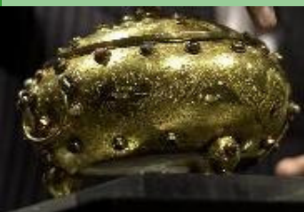
Ming dynasty jewel-embellished gold tripod vessel at Sotheby's