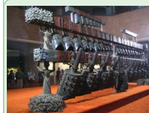
Marquis Yi of Zeng set of bronze bells

To take advantage of the Buddha's Birthday Weekend of May 9 th , we depart early Friday morning and return on the afternoon of Wednesday, May 14.