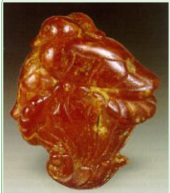
Amber container with mandarin ducks in lotus leaf motif Liao period, 11th century