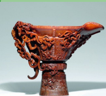
Carved archaistic rhinoceros horn libation cup at Christie's

The Imperial Sale features an Imperial blue and white "Dragon" vase with a Qianlong six-character seal mark, an Imperial gilt-bronze "Dragon" temple bell, an Imperial cloisonné enamel ice-chest, both from the Qianlong period, and an early Ming copper-red-decorated kendi ewer from the Hongwu period (1365-1398).