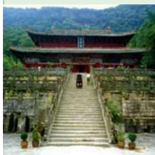
Zhenwu statue in bronze, Daoist architecture on Wudang Mountain